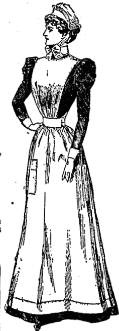
The "Rena" Apron. Made of linen finished Cloth lock-stitch throughout, 2/6 each. In two sizes, 36 in. & 39 in. from waist to hem.