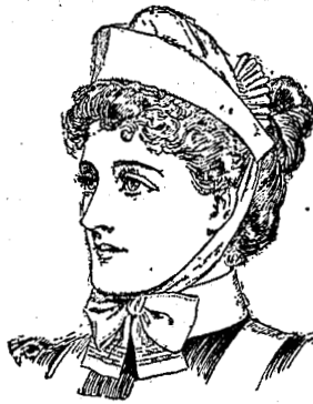
The New "Sister Dora" Cap. Made of washing Cambric, with draw strings. Can be washed as easily as a handkerchief. 1/-. Without strings, 10½d.