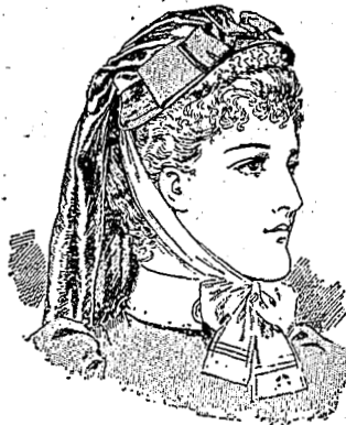
The "St. Bride's" Bonnet. Made of fine Straw with Lace and ruching, and trimmed with Ribbon, and long Silk Gossamer Fall. In black and colours, 12/6 each. Without Fall, 9/6; also The "St. Clare" Bonnet... 6/11 complete.